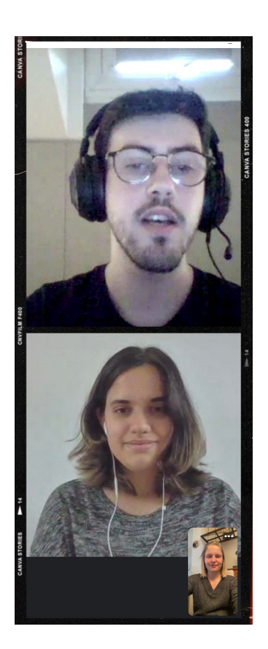
Sneak peek of the interviews with IT Experts and Recruiters